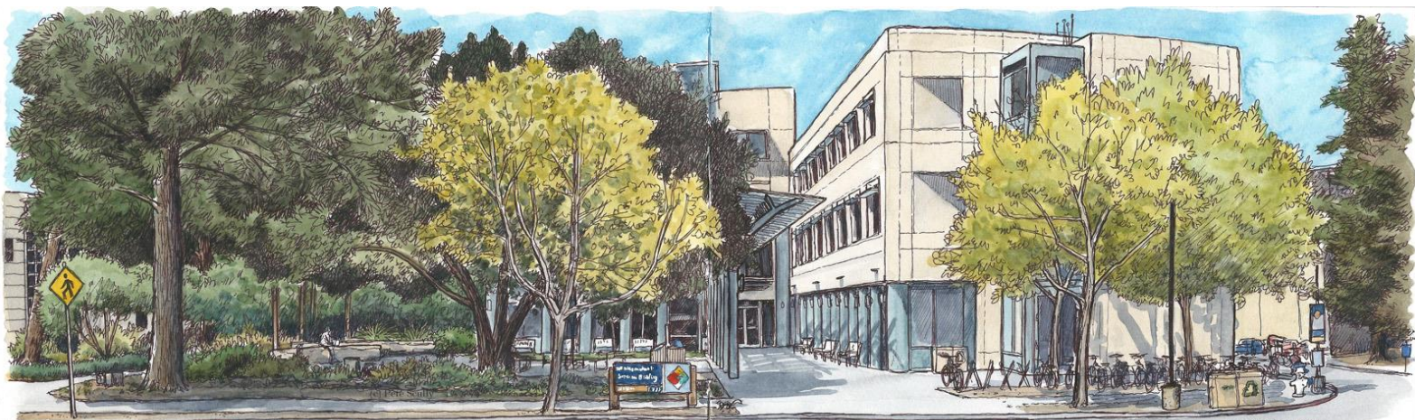
Mathematical Sciences Building, UC Davis